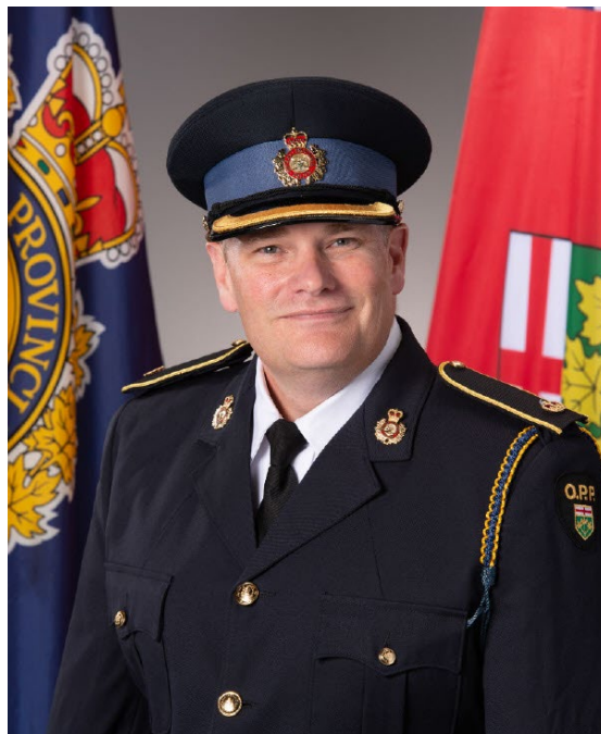
Grey-Bruce OPP Detachment Commander

Lastly, I wanted to thank the Police Service Boards and Councils for a warm welcome back to Grey Bruce and thank everyone for their participation in public safety.